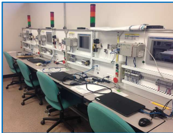
New PLC Stations

The White Welding & Machining Skills module includes two certification levels: White Basic Machining and White Basic Welding